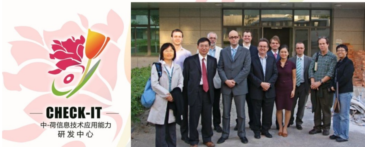
Figure 1. Start of CHECK-IT project in 2007 in the Software Park in Xiamen.

CHECK-IT is a consortium consisting of Software School of Xiamen University and partner Universities (2007-2013), Leiden University of Applied Science, The Hague University of Applied Science, Zuyd University of Applied Science, HAN University of Applied Science, Leiden University, and Laurea University of Applied Science. Two institutions of the partner universities (ICLON and the Institute of Education, Xiamen University) offer educational and cross-cultural advisers.